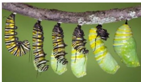
To the left: Monarch caterpillar forming its chrysalis

Their talk ended with the release of butterflies which circled around the gazebo to the delight of the crowd.