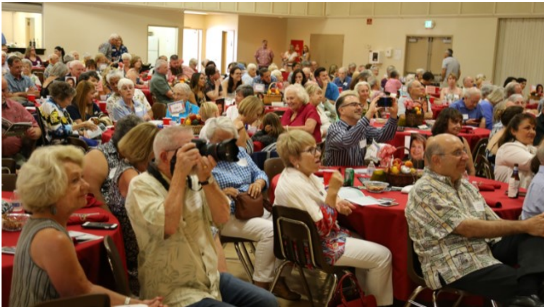
The audience watches the introduction of the honorees at the barbeque.