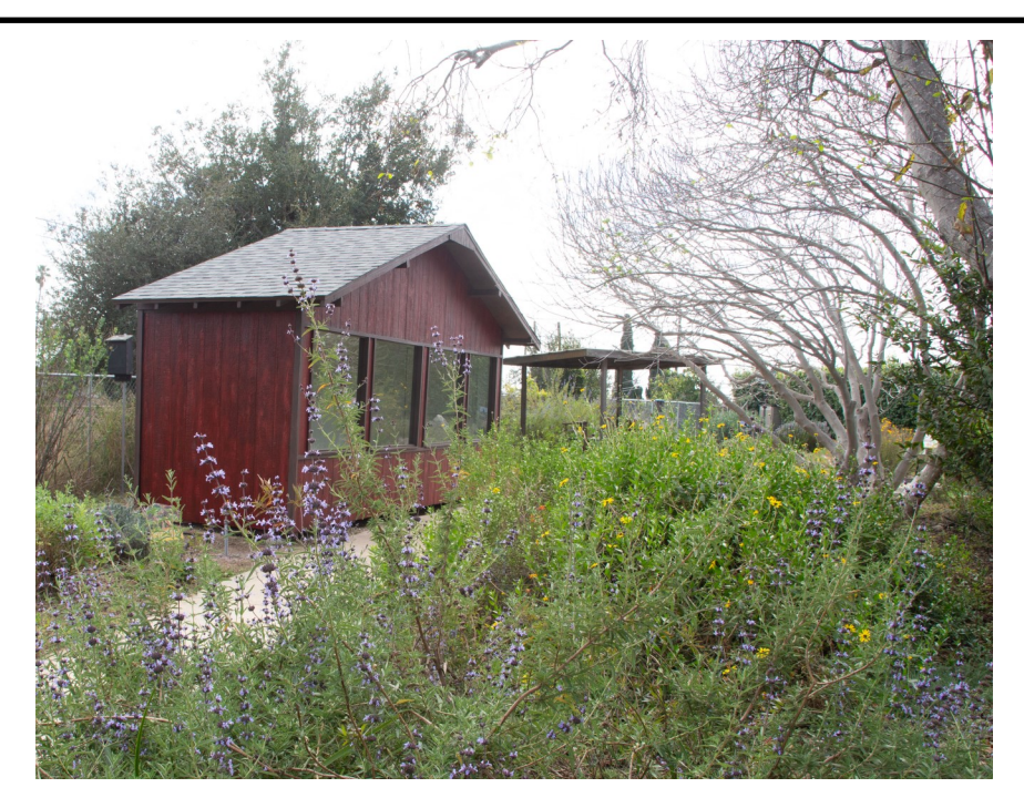
The Charles Honn Botanical Garden features a new "Barn Display" room

This 20' x 6' enclosed barn displays mostly farm, home and garden tools of the area. A turn-of-the century forge is there along with billows, tongs, and the like. Small plows, scales, local orange crates, and more that we have not had room to share will now be seen and protected. We are able to display our saddles and horse tack.