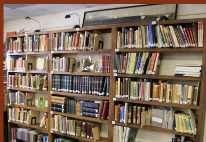
The Jack Fulkerson Research Library