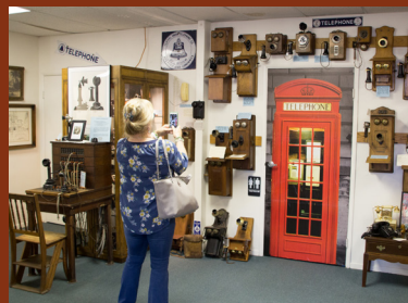
The Bill Doctorman Telephone Collection