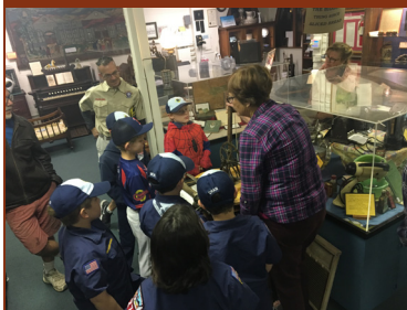
Scouts learning about history