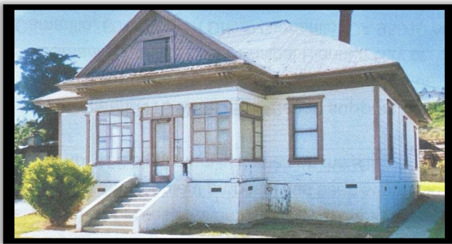
Empty, but prior to deterioration