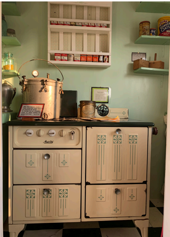
The kitchen features a 1920s Magic Chef range, appliances and utensils