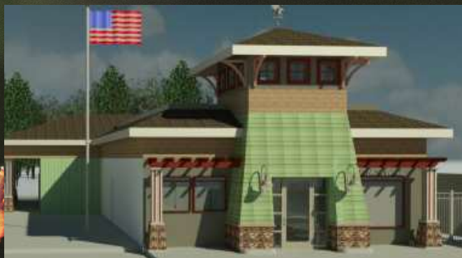
Architect's drawings of proposed expansion