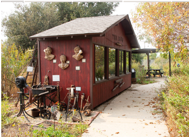
"The Barn" constructed in 2020 has a variety of ranch, woodworking and garage items