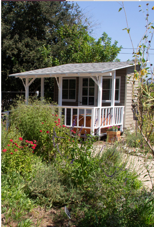
The "Back Porch" constructed in 2021, displays a copper washing machine, copper farm tub, and viewing of the kitchen.